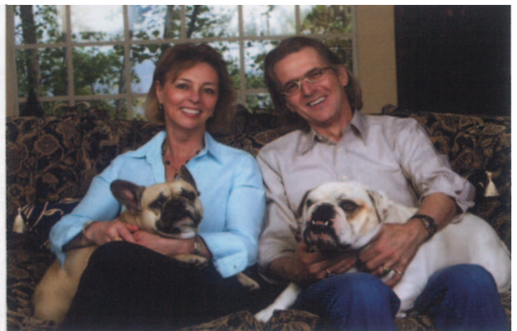
(Above Left): Tadmol Maskette, Papua New Guinea.

For the dealer or collector, however, that reality poses certain occupational dangers. "If ancestral spirits are not treated in a respectful way, bad luck will come," Hamson says. According to Hamson, the art world can be just as harsh. "You're only as good as your best piece," he says. —Lisa Stahl