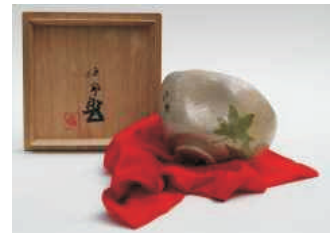
Tea bowl Takeuchi Seiho (1864-1942), c. 1925 Oranda Jin