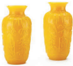
Pair of vases China, 19th century Asiantiques

carved opaque yellow glass vases dating to the 19th century (height 31.4 cm). Previously exhibited in Florida, the vases were published in the catalogue of the Ina and Sandford Gadiant collection.