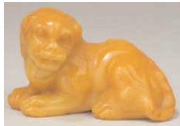
Buddhist lion China, 18th century

Since its inception in 1995, the New York Arts of Pacific Asia Show (APA) has become one of the cornerstones of New York's Asia Week, especially after the cancellation of the International Asian Art Fair in 2009. For the second year running, the fair will be held in The Market Suites at 7W New York, opposite the Empire State Building, and will open from 25 to 28 March, with an evening preview on 24 March. Sixty exhibitors have signed up, down from 78 in 2009. Many dealers believe that the fact that last year's show ended before the start of the auctions, which included the Sackler collection, adversely affected their business as buyers held onto their money to spend at these sales. This year, the show will run concurrently with the auctions. Together with a stabilization of the US financial markets this will, it is hoped, bring better results.