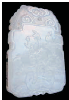
Plaque China, Qianlong period (1736-95) The Jade Dragon

86.4 cm). It is believed that only two such statues of Kannon were commissioned at the time; the other was presented to Puyi, the last emperor of China.