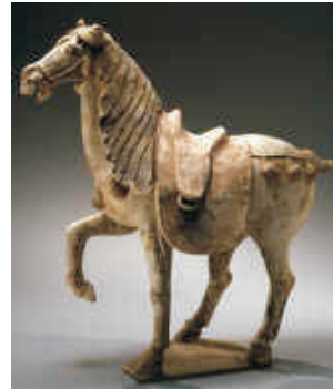
Horse China, Tang period (618-907)