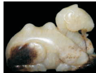
Camel China, Ming period (1368-1644) David Baker

Works of art and porcelain dating from the Song to the Qing period will be on view at David Baker . This year, jade carvings of animals from private