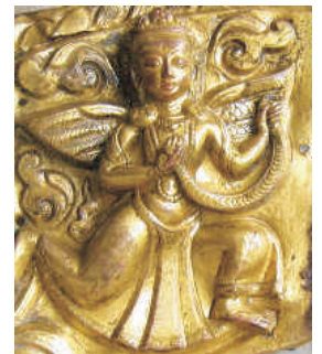
Detail of panel Nepal, c. 17th century Soo Tze

A pair of circa 17th century Nepalese repoussé architectural