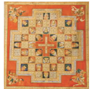
Yantra painting Burma, 19th century Chinalai Tribal Antiques

In tune with the concurrent Asia Society exhibition, Chinalai Tribal Antiques will present drawings, paintings, figures and furnishings in the Buddhist tradition. One work from the predominantly South-east Asian selection is a 19th