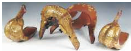
Saddle and pair of stirrups Japan, mid-Edo period (1615-1867) Flying Cranes Antiques