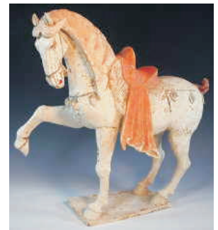
Horse China, Tang period (618-907)