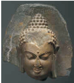
Buddha head Northeast India, Pala period, c. 11th century

Orientations Gallery looks forward to welcoming the many new collectors it forged relationships with last year. The exhibition of metalwork objects features shakudo and shibuichi